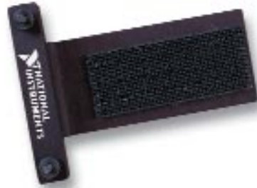
Figure 3. PCMCIA Cable Strain Relief Kit