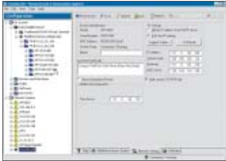
Figure 2. MAX provides quick setup for your FieldPoint network. For example, the Find Devices function searches the entire RS-232/RS-485 network for all FieldPoint devices.